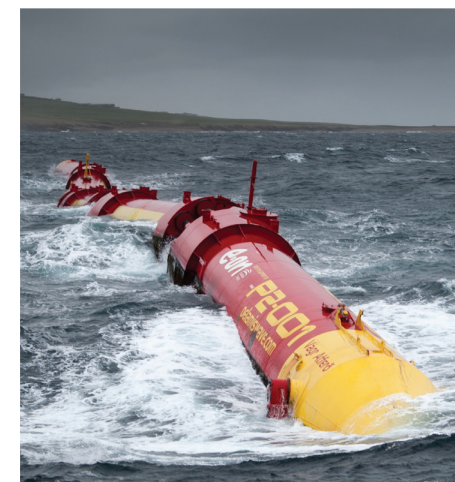
Wave Energy Converter