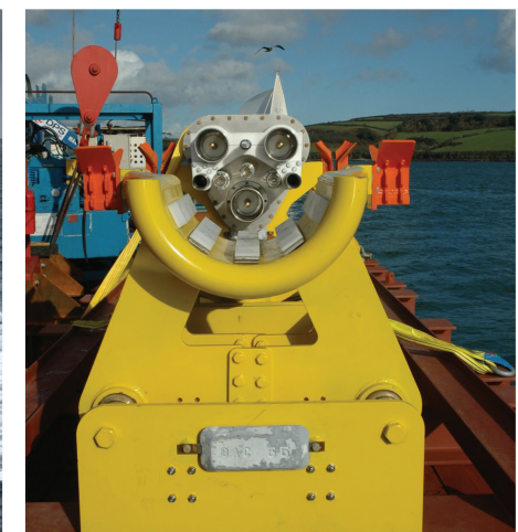
11kV Wet-mate Connector