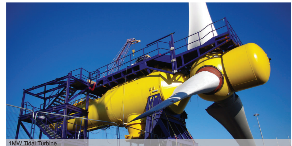
1MW Tidal Turbine